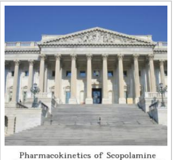
Pharmacokinetics of Scopolamine Intranasal Gel Formulation (INSCOP) During Antiorthostatic Bedrest