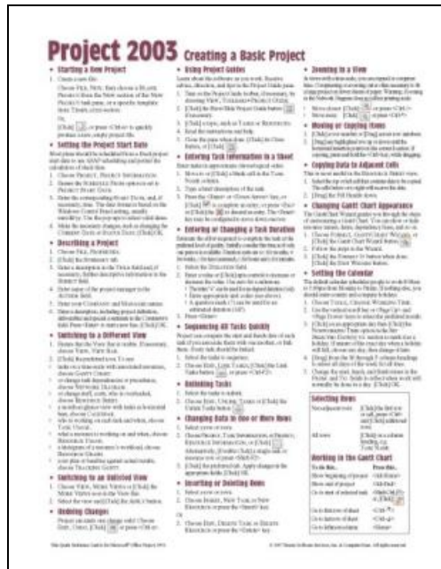
Filesize: 5.38 MB