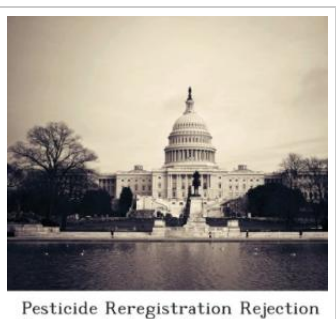
Pesticide Reregistration Rejection Rate Analysis Residue Chemistry: Follow-Up Guidance, June 1994