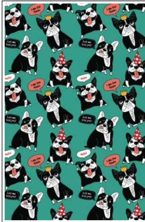
Filesize: 6.99 MB