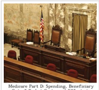
Medicare Part D: Spending, Beneficiary Out-of-Pocket Costs, and Efforts to Obtain Price Concessions for Certain High-Cost Drugs: GAO-10-529T

U.S. Government Accountability Office (GAO)