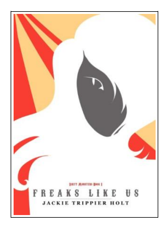
Freaks Like Us